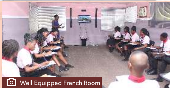
Well Equipped French Room