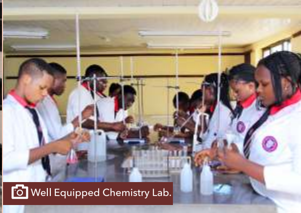
Well Equipped Chemistry Lab.