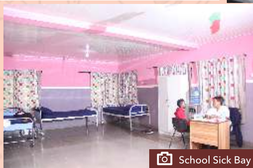
School Sick Bay