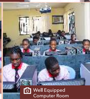
Well Equipped Computer Room