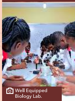
Well Equipped Biology Lab.