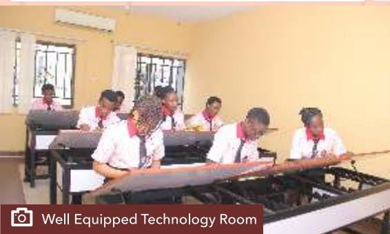
Well Equipped Technology Room